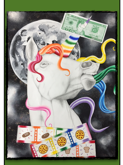
Grade 11 - Surrealism Artwork