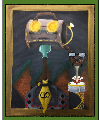
Grade 11 - Artwork