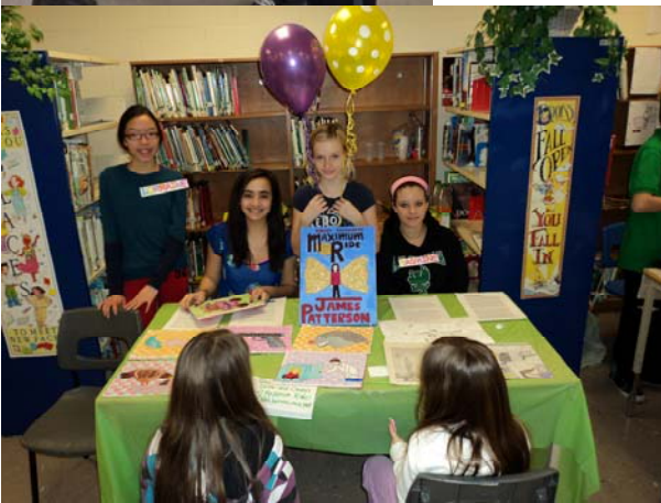
A fantastic Grade 7 Literacy Showcase was enjoyed by all!