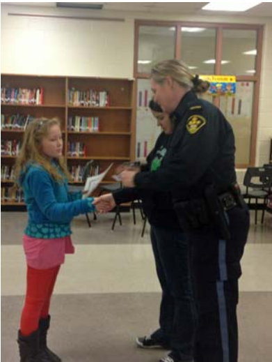
Congratulations to our VIP Graduates!